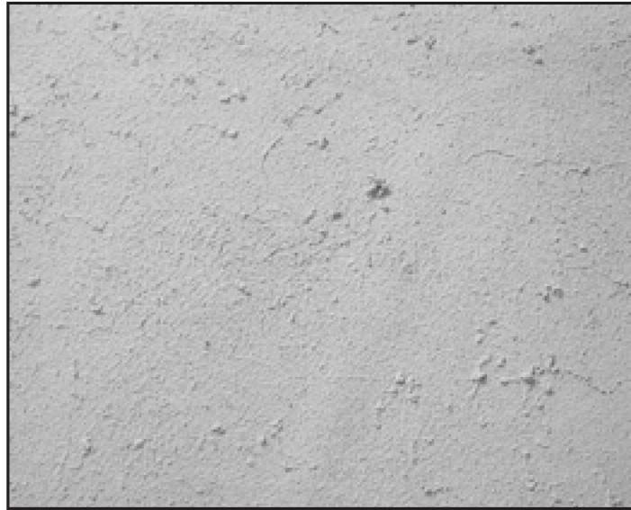
Photo 2. Example of over-mixing.

A slightly rough surface is to be expected with PERM-A-BARRIER® Liquid, if the spray fan is even and thickness control good then this is not a problem. At high temperatures Part A and Part B mix together more freely and if they become over-mixed then the surface of the PERM-A-BARRIER® Liquid will be excessively rough and the spray fan may appear stringy (see photo below).