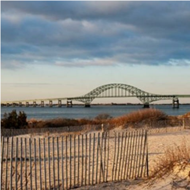
Fire Island Inlet Bridge chooses ELIMINATOR ® waterproofing