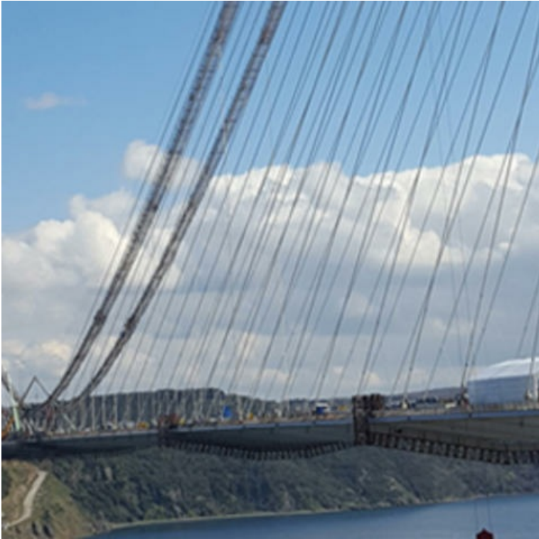
ELIMINATOR ® bridge deck waterproofing system chosen to protect world's longest combined road and rail bridge