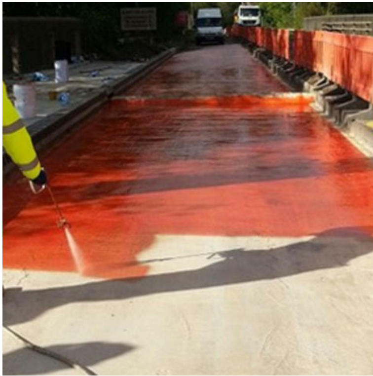
Crumlin Bridge Protected with Spray Applied Waterproofing