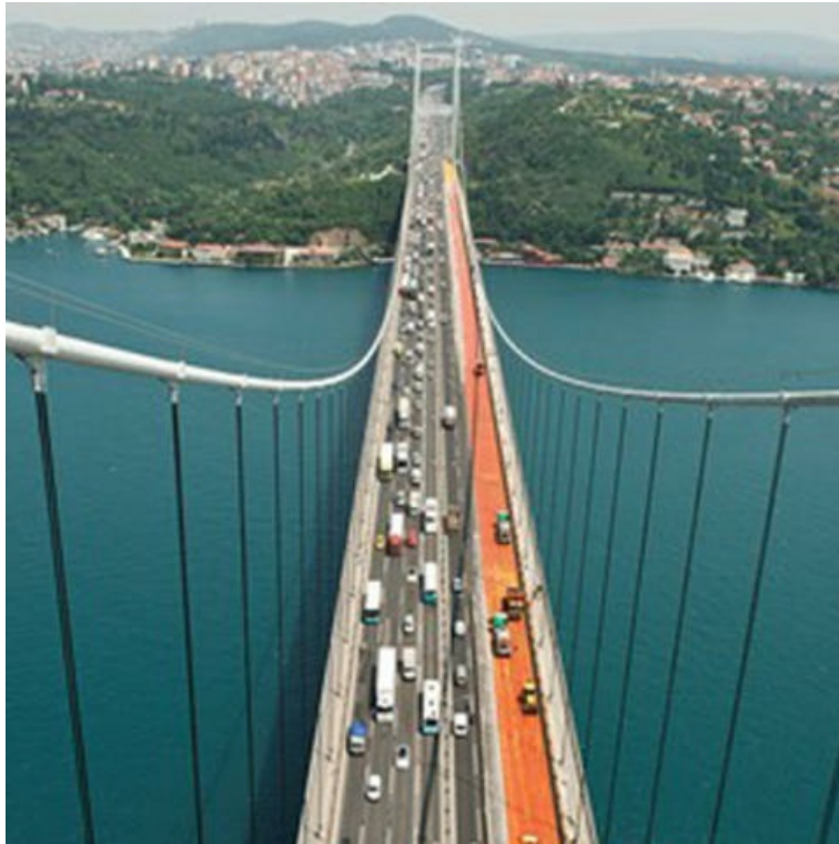
ELIMINATOR ® bridge deck waterproofing membrane