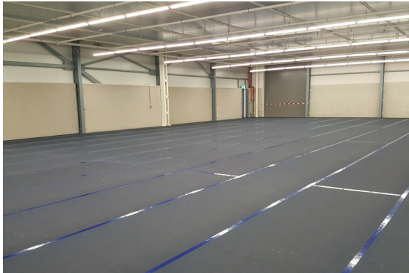
KOVARA™ MBX membrane & KOVARA™ MBX seam tape

KOVARA™ floor underlayments alleviate many environmental concerns that often come with installing moisture barriers. The membranes emit no VOCs (per California Specification 01350), eliminating a potential source of noxious fumes. Also, installation of the membrane does not require shot blasting, which generates silica dust and debris at the job site. This further reduces costs since there's no need for HEPA vacuums or sealing of ventilation systems while the work is being done.