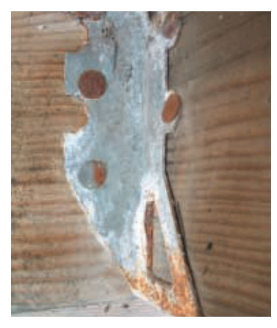
Galvanized joist hanger attached to ACQ wood, 7 months; wet conditions.