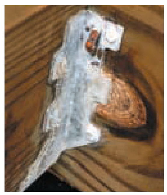
Galvanized joist hanger attached to ACQ wood, 7 months; wet conditions.