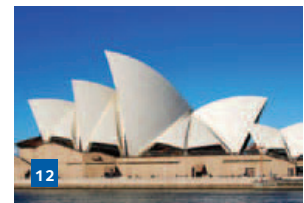
10 MAXXI | Roma, Italia 11 ArtScience Museum, Marina Bay Sands | Singapore 12 Sydney Opera House | Sydney, Australia