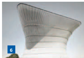
4 Experience Music Project | Seattle, WA 5 Ibero Camargo Museum | Porto Alegre, Brazil 6 Museo Soumaya | Mexico City, Mexico