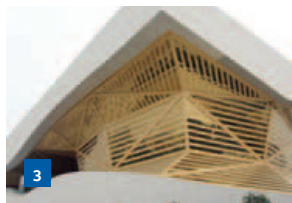
1 Masdar Institute of Science & Technology | Abu Dhabi, UAE 2 EPCOT Theme Park | Orlando, FL 3 Wuxi Museum | Wuxi, China