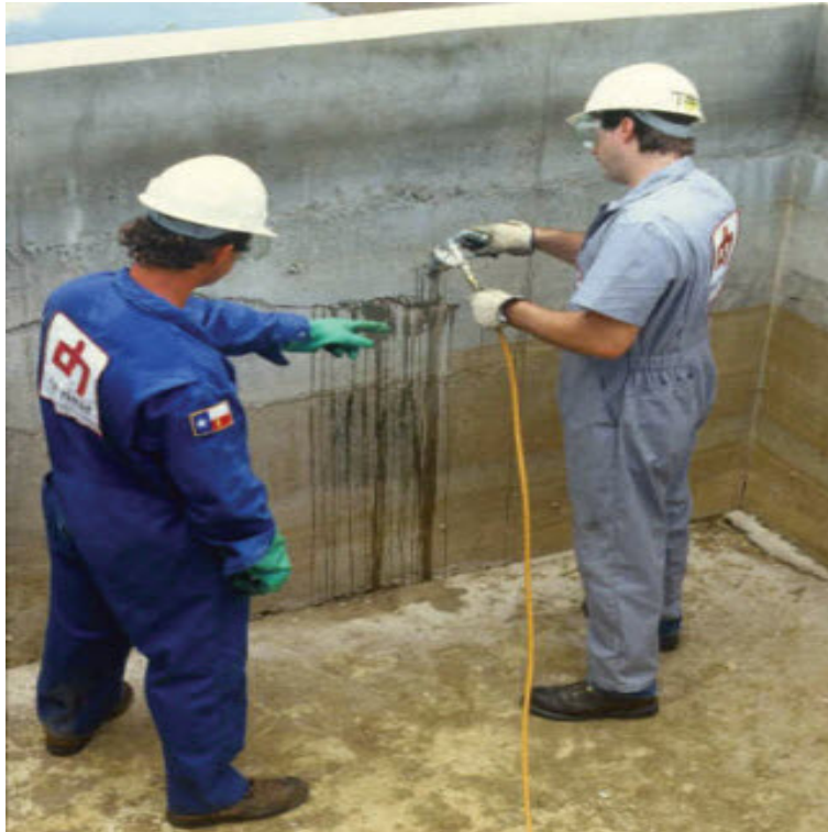
Figure 8. Flushing crack with water.

Note: Injection pressure will vary from 200 psi to 2500 psi depending on the width of the crack, thickness of concrete and condition of concrete.