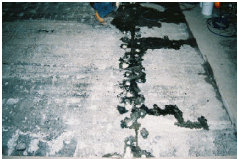
Figure 11. Port to port grout show