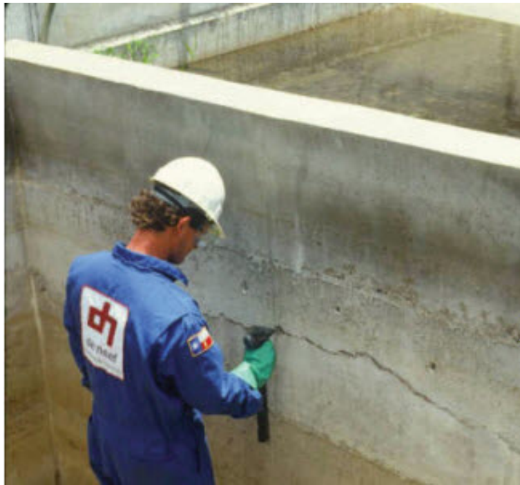
Figure 1. Preparing the crack..