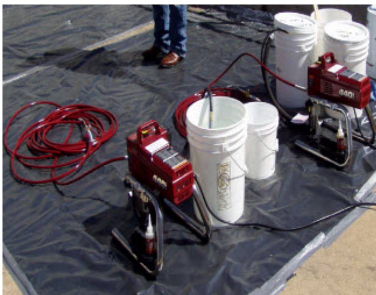
Figure 7. Two pumps: one for water and one for grout.