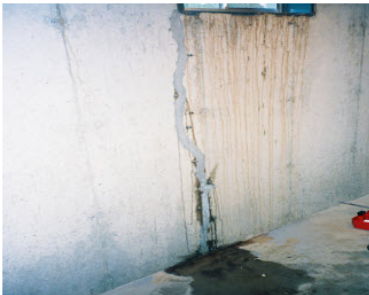
Figure 3. The lines show the port spacing. Closer at the bottom where the crack is tighter, further apart at the top where the crack widens.