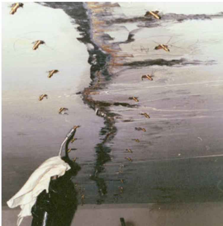
Figure 6. Drill pattern on overhead crack.