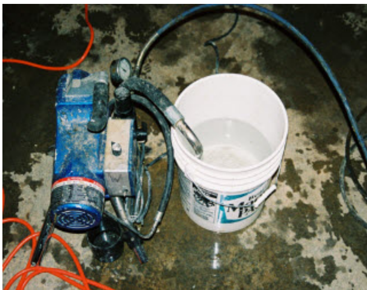
Figure 13. Always flush lines thoroughly.