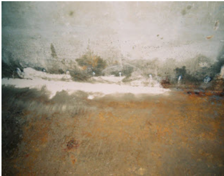
Figure 12. Dry, grouted joint.