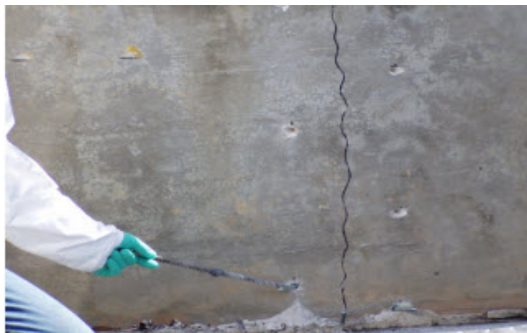
Figure 5. Installation of packers