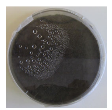
Fig2: Spores Viability control - heavy fungal growth © Accugen labs

Fig1: Lab# 96688 at Nutrient Salt agar inoculated with fungal spores at 28 days in triplicate Test sample did not support any fungal growth. © Accugen labs