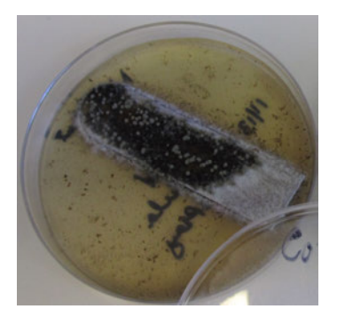
Fig3: Positive control - heavy fungal growth © Accugen labs

Fig2: Spores Viability control - heavy fungal growth © Accugen labs